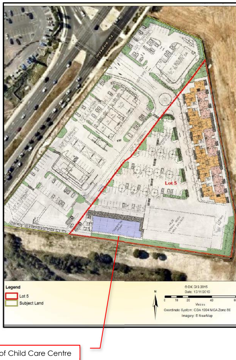
Figure 2: Future Lot 5